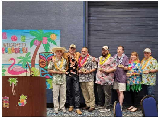
2022/203 OCEA Board received recognition

Thank you to everyone that attended our Spring Conference. We had nearly 125 in attendance! The luau themed banquet seemed to be a hit. Several of you signed up to serve on various OCEA Committee's. You should hear from your Committee Chair soon to begin working together. The Board just went over the Conference Survey Results at our May Board meeting and will work to cover the topics you requested at our upcoming events. We hope to see you in the Fall at our conference in McAlester! More details will be shared soon about that.