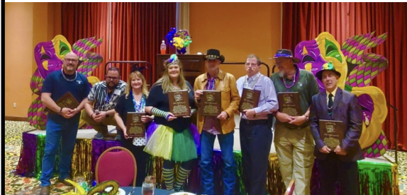
2024-2025 OCEA Board at the Banquet